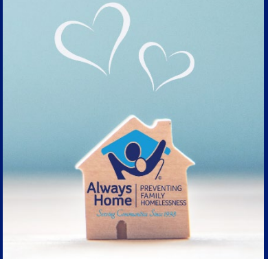
Amount spent to stabilize families: